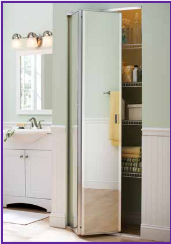
Pictured in a Bright Clear finish with Duraflect® copper-free mirror