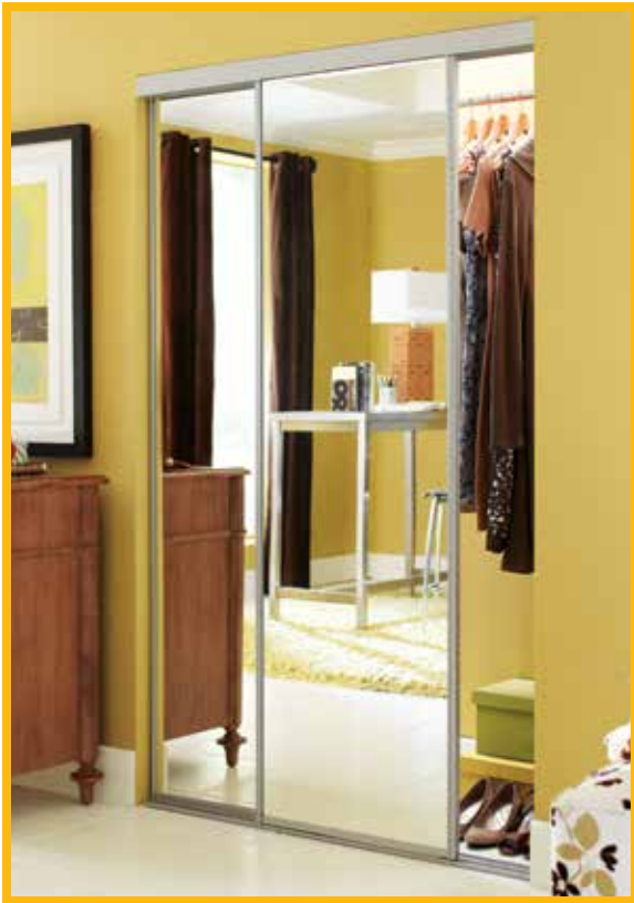
Pictured in a Silver Nickel finish with Duraflect® copper-free mirror