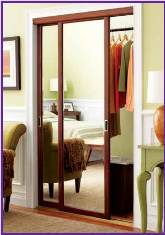
Pictured in a Dark Stain finish with Duraflect® copper-free mirror