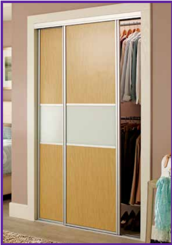
Pictured in a Satin Clear finish with Maple wood grain inserts and Snow White back painted glass inserts