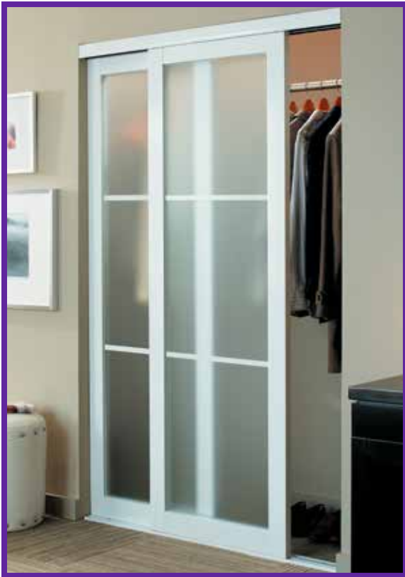
Pictured in a White finish with Mystique™ Duratuf® tempered safety glass